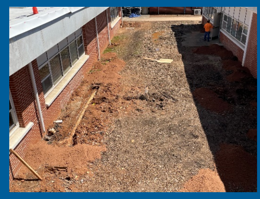
Grading and repairing drainage at West courtyard