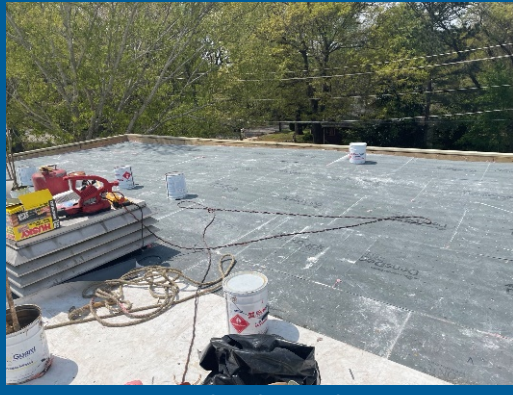
Final area of roof being finished