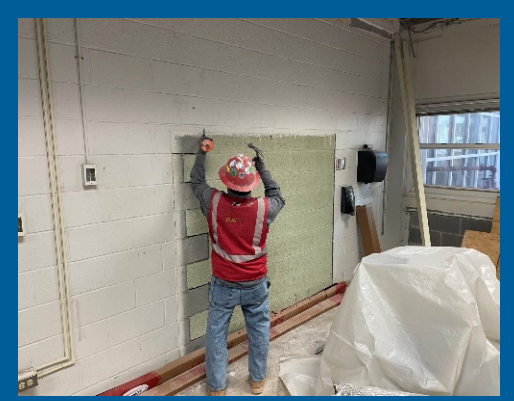
CMU Block demo for replacement infill