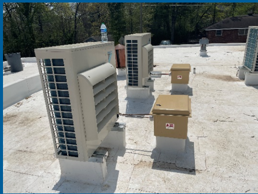
Routing condensate lines to rooftop VRF