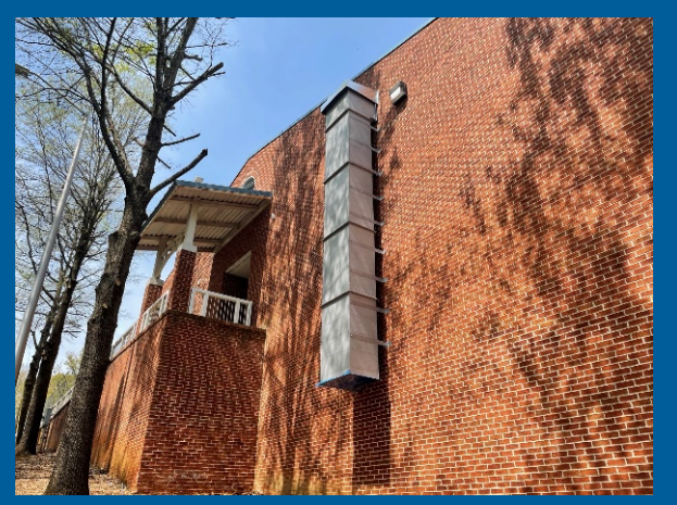
Exterior HVAC Duct Work Installed