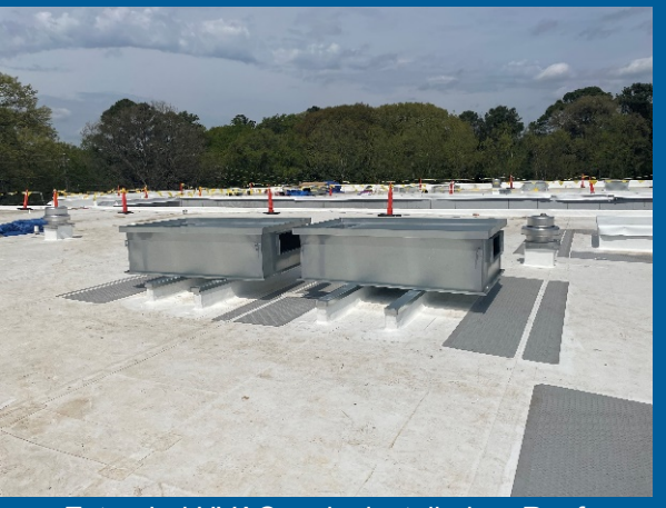
Extended HVAC curbs installed on Roof