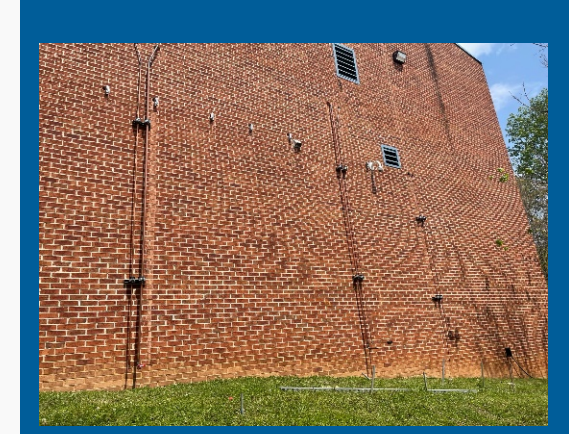
Condensate Lines installed at Gym Area